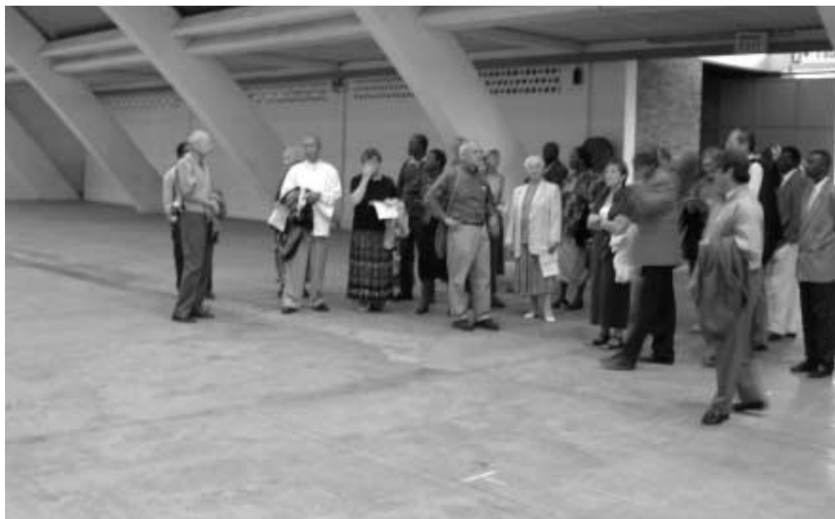
MWC Executive Committee members look over Hall 3 at the Zimbabwe International Exhibition Centre in Bulawayo. The mass Assembly Gathered sessions are scheduled to be held here.

The statement reaffirms the decision of the MWC General Council in 2000 to say "yes" to an invitation from Mennonites and Brethren in Christ in Africa to hold the 14th MWC assembly in Bulawayo, headquarters for the 27,000-member BIC Church of Zimbabwe. In recent months some people, particularly in North America and Europe, have questioned the advisability of holding a large international gathering in Zimbabwe. The questions focus on three issues: