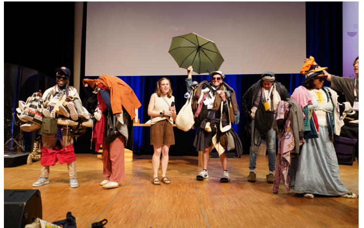
The Global Youth Summit (GYS) at Schönblick, Schwäbisch-Gmünd, Germany, 30 May–1 June 2025. Youth and young adult participants dramatize a lesson during teaching time.