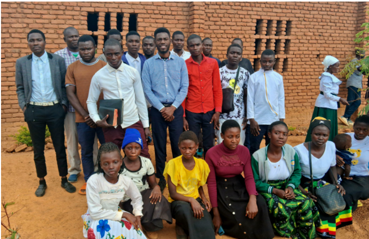
Youth from the Mennonite Brethren church in Mozambique (led by the MB bishop from Malawi) discuss the challenges and opportunities of youth ministry in their context.