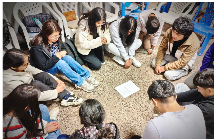
Conferencia Menonita del Cusco, Perú