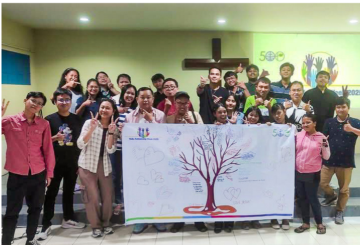
GKMI Kudus, Indonesia