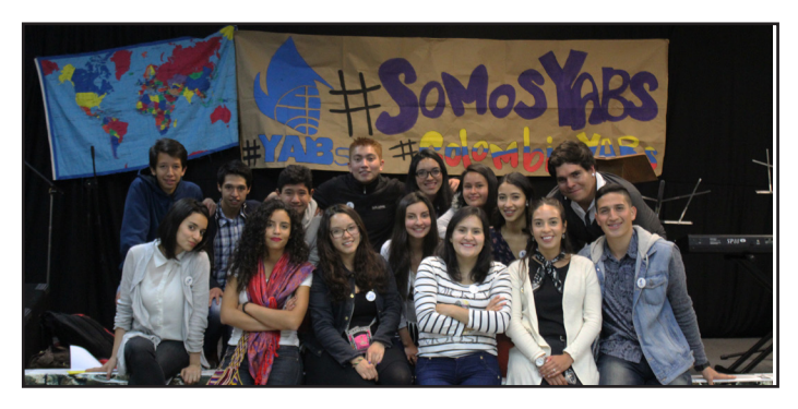
A YABs celebration with Mennonite and Mennonite Brethren congregations at Dios es Amor de los Hermanos Menonitas in 2016.