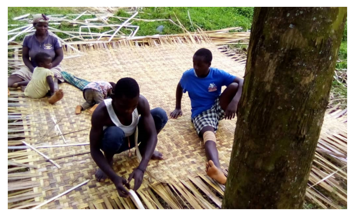
Youth from Mennonite Church Uganda work on a project for the church and community.