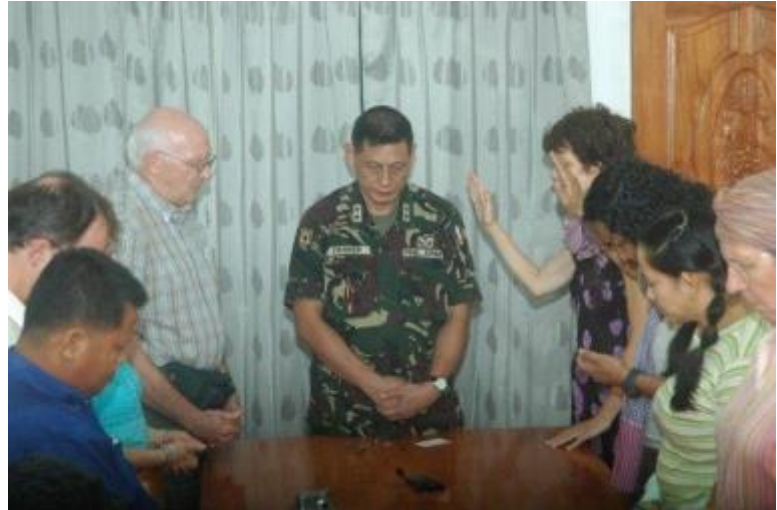
A Mennonite peace delegation prays with a Philippine general.

A Philippine military general faced an agonizing dilemma. His orders were to move against the Moro Islamic Liberation Front (MILF) in Mindanao: an action that would surely be bloody and lethal. Ironically, this general is a graduate of a Mennonite peacebuilding institute where he learned about a wider spectrum of possibilities; and now he was searching for a less violent alternative.