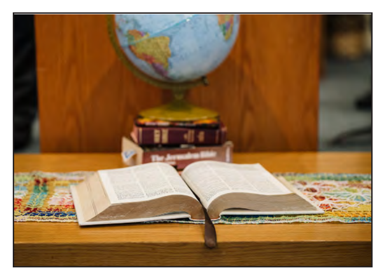
Celebrating World Fellowship Sunday 2017 at Crossroads MB Church, Winnipeg, Canada.

address complex problems, we look for others to blame.