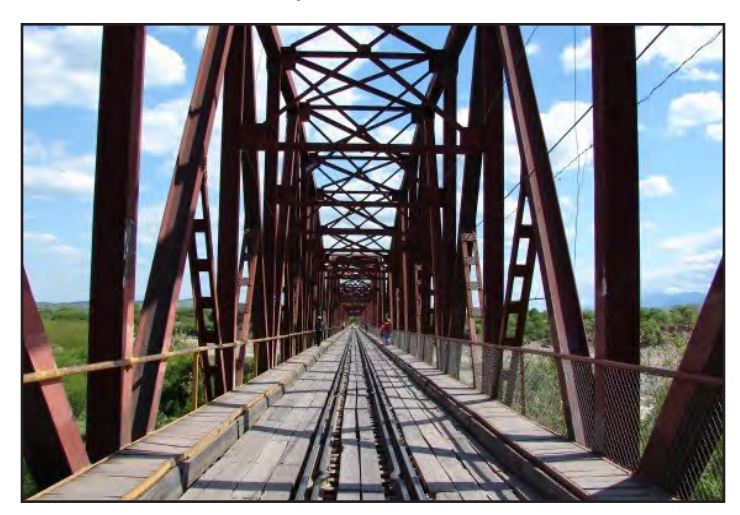
Santa Cruz, Bolivia.

A peace church is called to work on both of these levels at once. We must boldly seek justice in the public square while building bridges of reconciliation with our neighbours, even those who hold different positions.