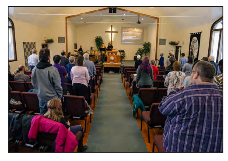
Celebrating World Fellowship Sunday 2017 at Crossroads MB Church, Winnipeg, Canada.