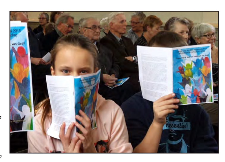
Celebrating World Fellowship Sunday 2015, Mennonite congregations Groningen-Drenthe, the Netherlands.

When Ephesians was written, the division between Jews and Gentiles went so deep that our text refers to it simply as "the enmity" or "the hostility." Jesus is confessed as "our peace" because through his ministry, death, and resurrection (2:4–10), the division between