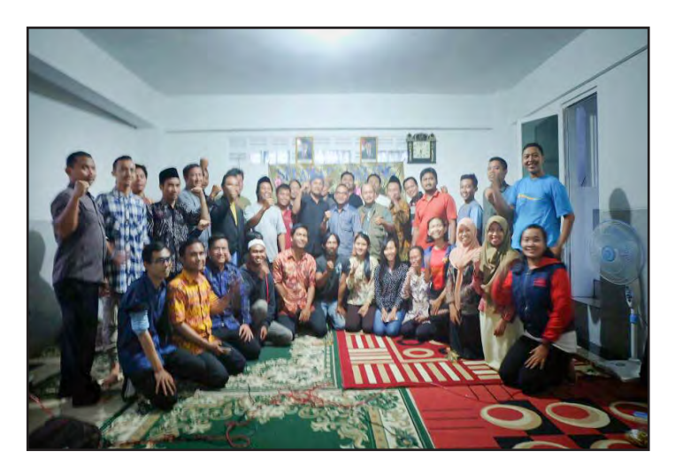
An 'interreligious live in program', at an interfaith meeting, young church leaders, including many GITJ (Gereja Injili di Tanah Jawa – Javanese Mennonite evangelical church) pastors, stayed at an Islamic boarding school with young Muslim, Budhist and Hindu church leaders for two days.

To confess Christ as "our" peace is a confession we do not make by ourselves. Jesus is most faithfully confessed alongside those we would just as soon keep at arm's length, who threaten or disturb our "comfort zone," whether we think of ourselves as individuals or as congregations. To be "born again" is never a solitary experience. We are born together into the "new human" together with our enemies. So be careful! The chain of peace, with which we are tied to each other and to Christ (4:3), more often than not chafes.