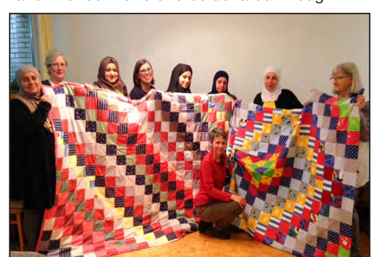
A finished quilt made by the quilting group at Friedenshaus.

One concrete way we live our mission statement is through our quilting group. Every Monday evening, a group of 12–20 quilters (mostly women) gather to cut fabric, sew squares and knot comforters to be donated through