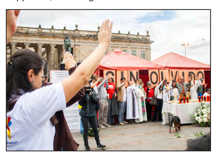
Members from Mennonite agencies, Justapaz and Mencoldes, join in an ecumenical prayer for peace in Bogotá, Colombia, led by DiPaz (Diálogo Intereclesial por la Paz, Inter-ecclesial Dialogue for Peace).

Some of these bridges are already built. Mennonite congregations and organizations in Colombia are accompanying victims of the armed conflict and other forms of violence. They have documented the wounds of violence; supported, encouraged and advocated for