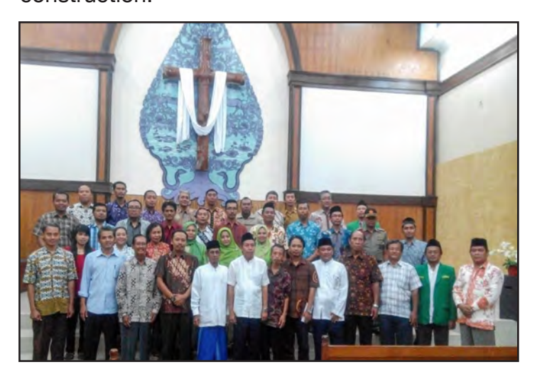
In 2015, GITJ (Gereja Injili di Tanah Jawa – Javanese Mennonite evangelical church) pastors and Nahdlatul Ulama (an Islamic organization) held a meeting in the GITJ Jepara church.

In vv. 19-22 "you" and "we" together become one family, indeed, one temple, God's home. Notice that God's home is made of stones not only from the covenant community quarry (the "we" in this passage), but more dramatically from the landfill site of rejected stones (the "you" in this passage). God's home is a massive recycling project, we might say. This temple - the reconciled and re-created people of God – is a powerful witness to God's grace. In its very existence, this temple is a subversive presence of retrieved and rescued "living stones" in a culture of fear and suspicion; a profound and sociologically visible witness to the radical hospitality of the One who is "our Peace." God loves to live in a home of rescued building materials, in a home permanently under construction.