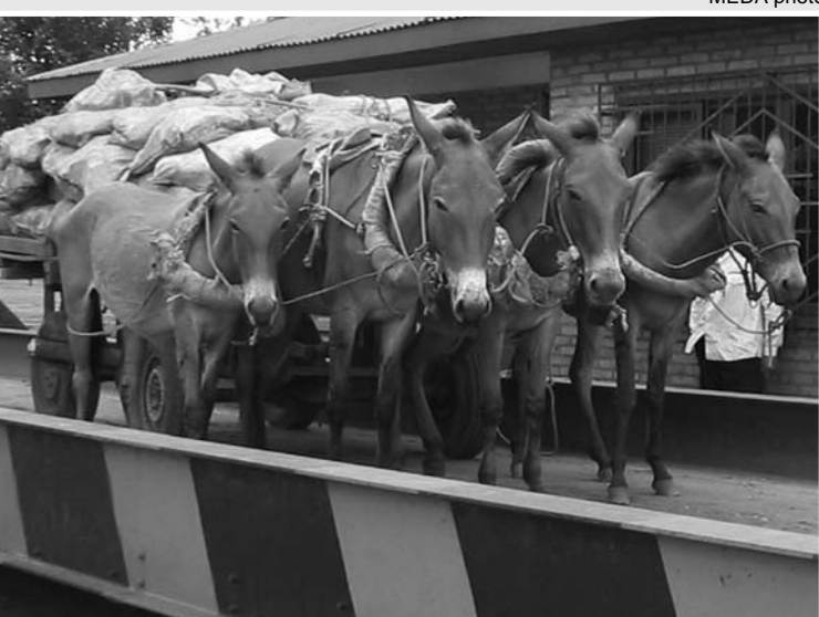
A cart of manioc waits on a scale at one of the CODIPSA starch processing plants. CODIPSA is a joint venture between MEDA Paraguay and local Mennonite business people.