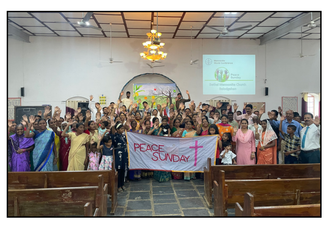
Bethel Mennonite Church in Balodgahan, India celebrates Peace Sunday 2022.

With permission, send your story and photo to <a href="mailto:photo@mwc-cmm.org">photo@mwc-cmm.org</a> to share with the global Anabaptist family.